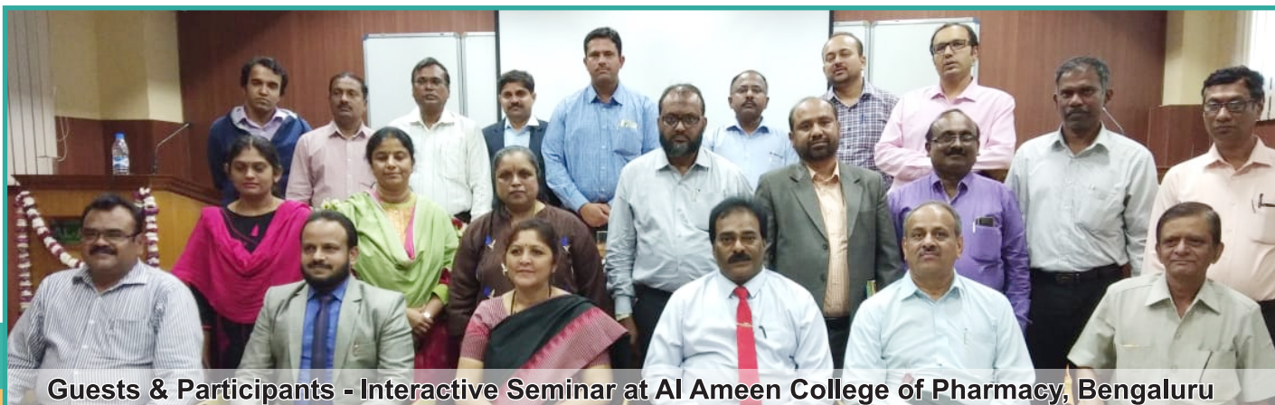
Guests & Participants - Interactive Seminar at Al Ameen College of Pharmacy, Bengaluru

One day interactive seminar was held for about 60 selected faculty of Pharmacy colleges in Karnataka on 23rd Feb. 2019 at Al Ameen College of Pharmacy Bengaluru, from 09.30 am to 04.30 pm.