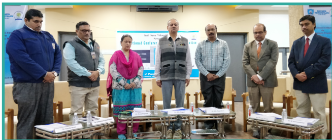
KBIPER, Gandhinagar, Gujarat. Dec. 2018