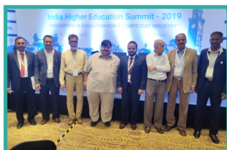
India Education Summit, Mysuru, March 2019