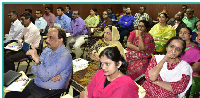
Guests & Participants - Interactive Seminar at AI Ameen College of Pharmacy, Bengaluru